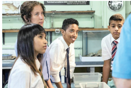
PUPILS have taken a liking to marine sciences, a subject piloted at schools at the start of the year.