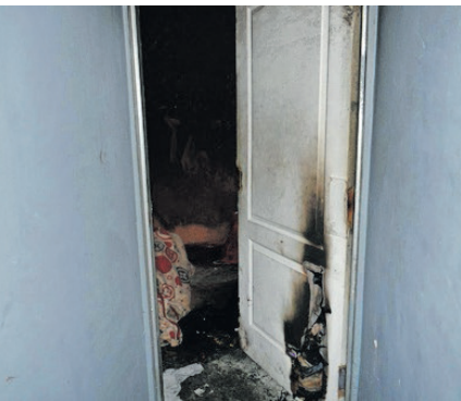
THE killers of the seven men shot dead in Philippi tried to burn the bodies of the victims.