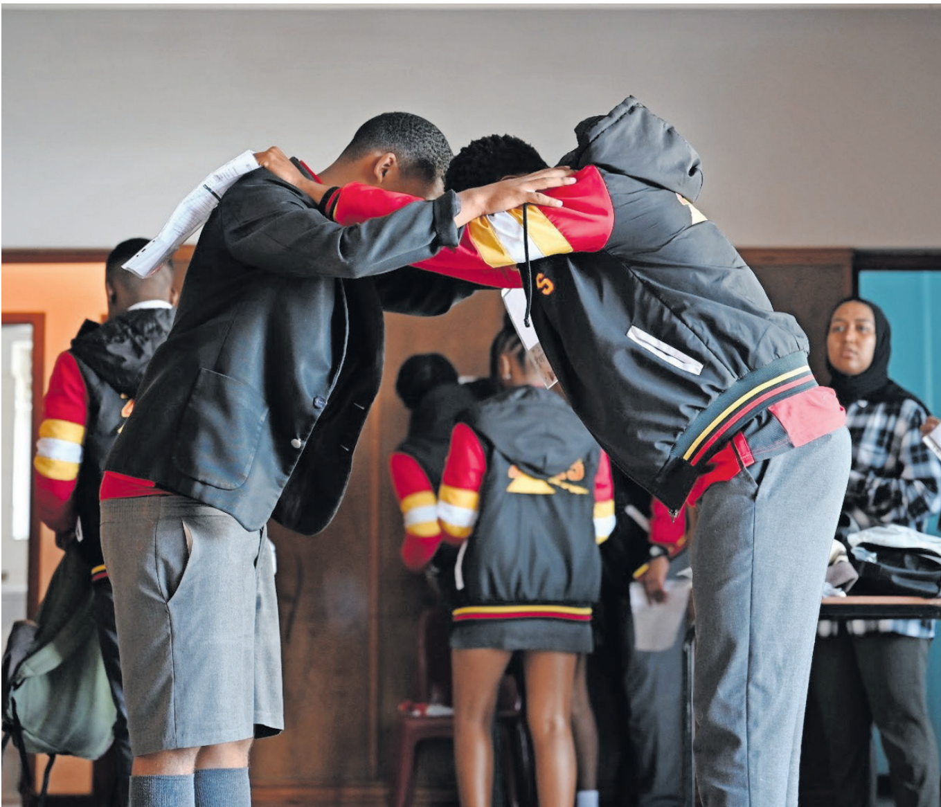
SEA Point High School matric pupils were among more than 900 000 National Senior Certificate (NSC) candidates nationwide writing their exam this year, marking the highest number of learners to sit for the NSC since its inception in 1996. Minister of Basic Education Siviwe Gwarube has expressed confidence in the department's readiness, assuring that measures were in place to ensure a fair and accessible examination process.